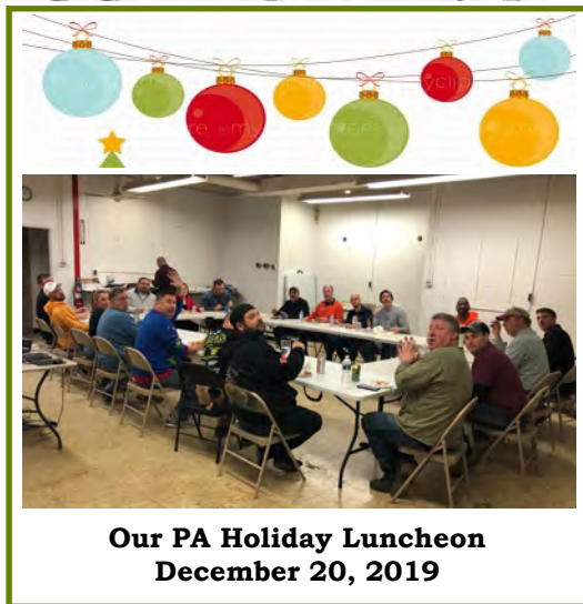
Our PA Holiday Luncheon December 20, 2019